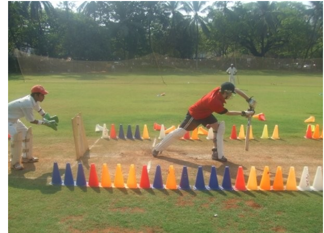
The WCA special learning sessions with special learning equipments