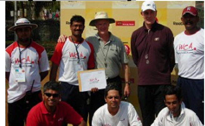
WCA TEAM with Greg Chappell during the Cricket Star