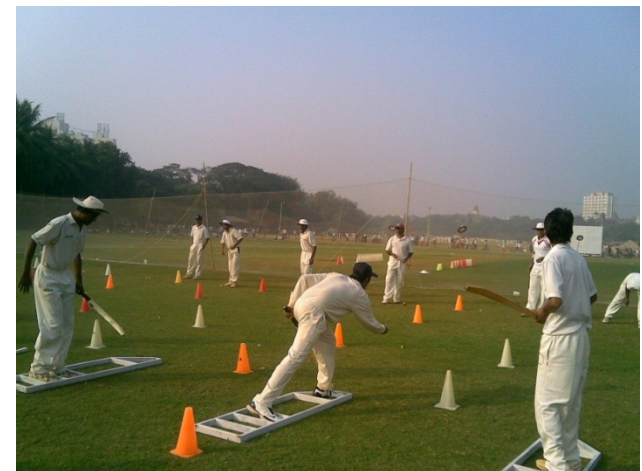
WCA trainees using batting matrix during the batting session